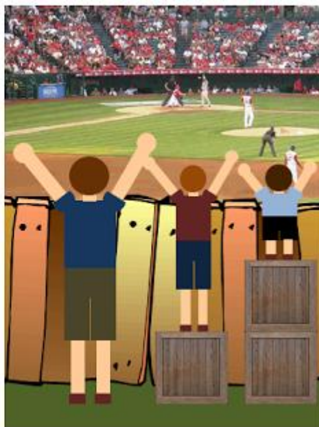
EQUITABLY Special treatment for some to give them a chance to see

https://medium.com/@CRA1G/the-evolution-of-an-accidental-meme-ddc4e139e0e4