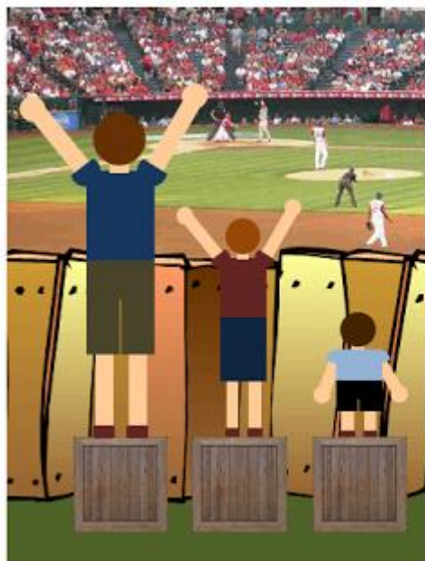
EQUALITY Treating everyone the same

changes are needed for progress. A TA will carry out pupil voice work with children to find out about their learning experience and parents are also given opportunity to contribute to the PCPs.